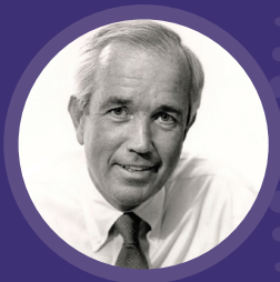
Robert R. Redfield, MD, Director, Centers for Disease Control and Prevention

“ There are health priorities within CDC that we can advance. The CDC Foundation can make that connection, which gets to the core of its mission of helping CDC do more, faster. ”