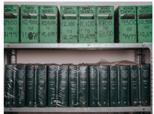
Department of National Registration, Passport, and Citizenship (DNRPC) in Lusaka, Zambia.