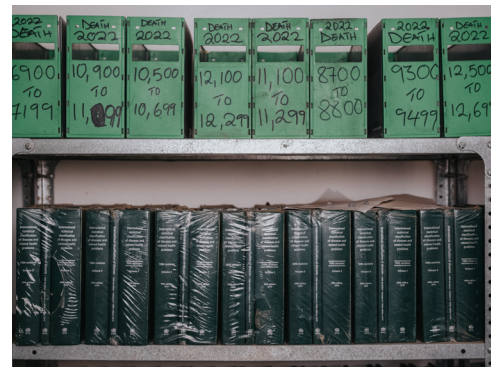
Department of National Registration, Passport, and Citizenship (DNRPC) in Lusaka, Zambia.